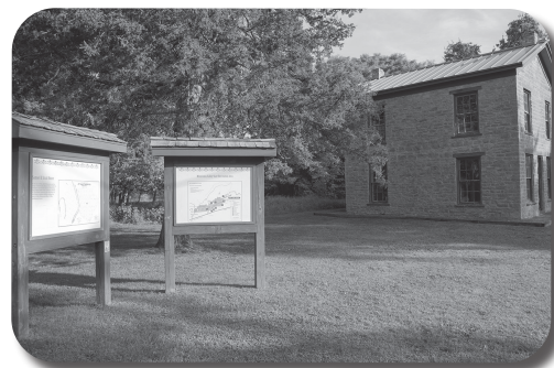
Enjoy historic sites like the Strait House in the Lawrence Unit.

The Minnesota Valley State Recreation was created in 1994 when several existing trails, and the land around them, were combined. Today, it protects 5,490 acres of diverse plant and wildlife communities. It also offers equally diverse recreation like hiking, biking, bird watching, horseback riding, snowmobiling and more.