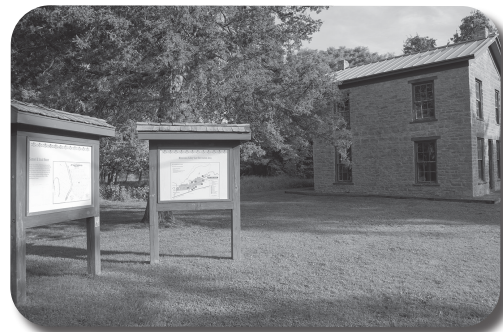
Enjoy historic sites like the Strait House in the Lawrence Unit.

The Minnesota Valley State Recreation was created in 1994 when several existing trails, and the land around them, were combined. Today, it protects 5,490 acres of diverse plant and wildlife communities. It also offers equally diverse recreation like hiking, biking, bird watching, horseback riding, snowmobiling and more.