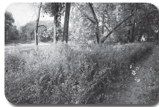
The trail travels closely along the Minnesota River and may be prone to flooding.

Purchase a horse permit at the self-registration kiosk and you and your horse can travel trail from Belle Plaine to Chaska. The terrain varies from flat to gradual inclines. Expect hills in the Lawrence and Carver Rapids units. An equestrian campground in the recreation area offers the chance for a longer trip. The Minnesota Valley State Trail is typically closed to horseback riders December 1 – May 15.